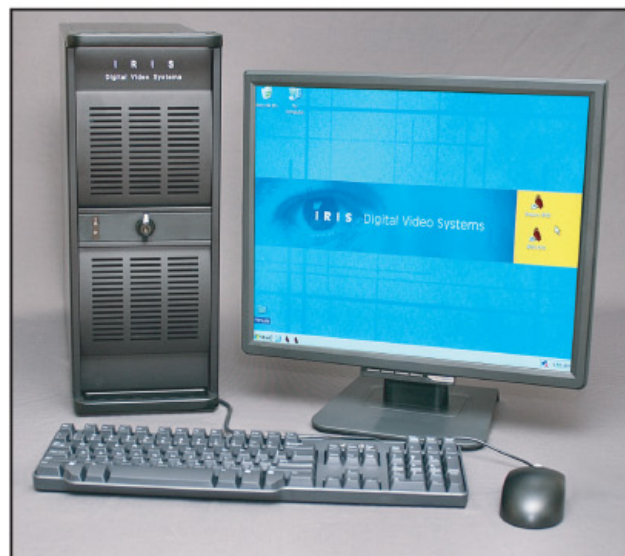
The DVS-FX Chassis may be configured as a Tower System or Rack-Mount with included flanges. Control switches and the DVD/RW Drive are mounted behind lockable doors. Cameras connect to the DVS-FX using either one (for 16-channels) or two (for 32-channels) Video Expansion Modules (included with System.)

IRIS DVS-FX systems are delivered with an embedded operating system, and IRIS Inquiry (video review and retrieval), Access Manager, and Service Manager software preinstalled.