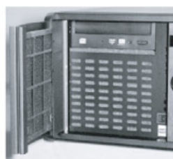
Control switches and DVD/RW Drive mounted behind lockable chassis panels