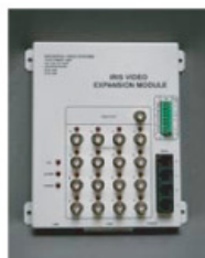
Video Expansion Module (one per 16-channels, included)