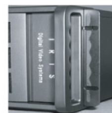
Includes Rack-Mount Flanges