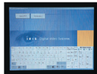
"On-demand" keyboard shown

IRIS Digital Video Systems 10750 Forest Lane Dallas, Texas 75243 888.451.4646 Fax: 214.349.9429 www.DigitalVideocc.tv