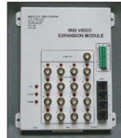
3032-FX includes Video Expansion Module